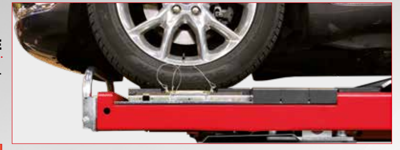
5_TURNTABLE Adjustable recess for the turntable.

Adjustable mechanical safety device , also for exact adjustment for wheel alignment.